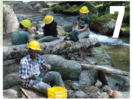
Youth from the Groundwork Rhode Island Crew performed trail rehabilitation on popular trails on New Hampshire's White Mountain National Forest.