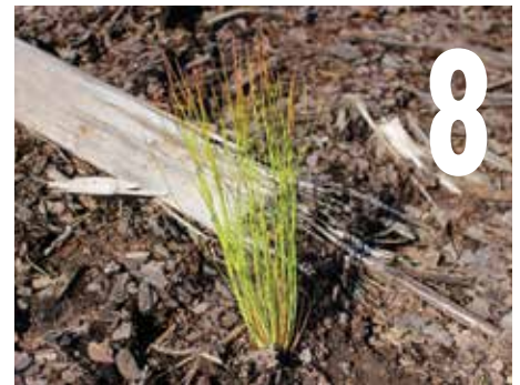
We planted over 200,000 longleaf pine seedlings on National Forests in Mississippi as part of the Longleaf Alliance, which is helping restore the species across the Southeast.