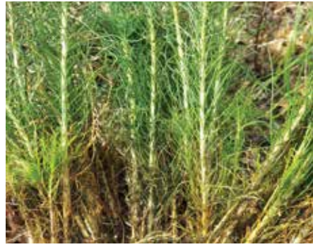
We planted 586,000 trees on Michigan's Huron-Manistee National Forest to provide habitat for the Endangered Kirtland's Warbler.