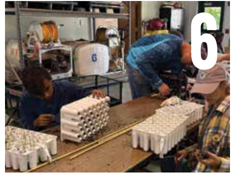
Youth from Chicago spent time at Midewin National Tallgrass Prairie, learning about and giving back to public lands.